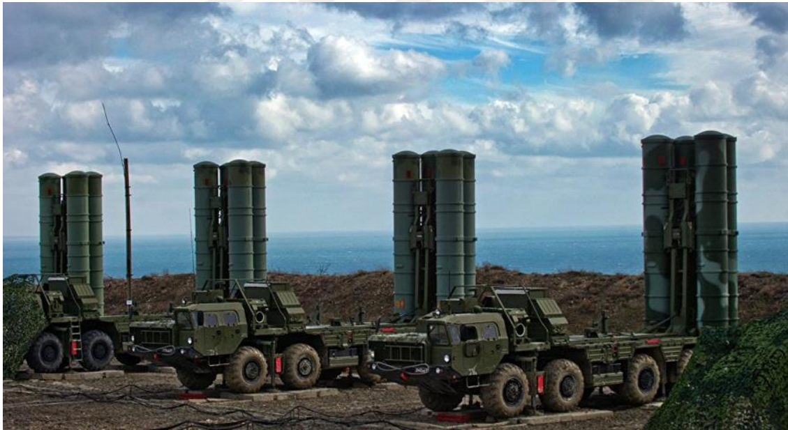
Figure 4.1 Surface to air S-400 Triumph missiles

On the other hand, the Russian side is so eager to sign this agreement. agreement. Russia itself has proposed to Iraq the S-400 air defense system to protect its airspace, the country's sovereignty, and reliable protection of airspace."