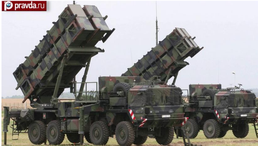
Figure 4.2 Patriot surface to air missile system

procurement process in motion. In addition, Saudi Arabia, Morocco, and Iraq are said to be in negotiations to buy the system https://regnum.ru/news/polit/2734200.html .