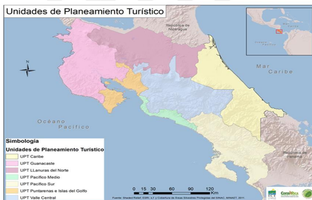
Figure 1: Tourism Planning Units (UPT) in Costa Rica

The analysis needs a reference category in order to avoid perfect colinearity problems. Our reference category is then defined as "a leisure tourist, who comes for the first time to the country, in the first quarter of the year, comes with job colleagues, the trip has been organised by other institutions (university, etc.), stays at a hotel/cabin/camping, male, aged over 55 years, other civil state than married or single, with tertiary level of studies (master degree or doctorate), and from European origin".